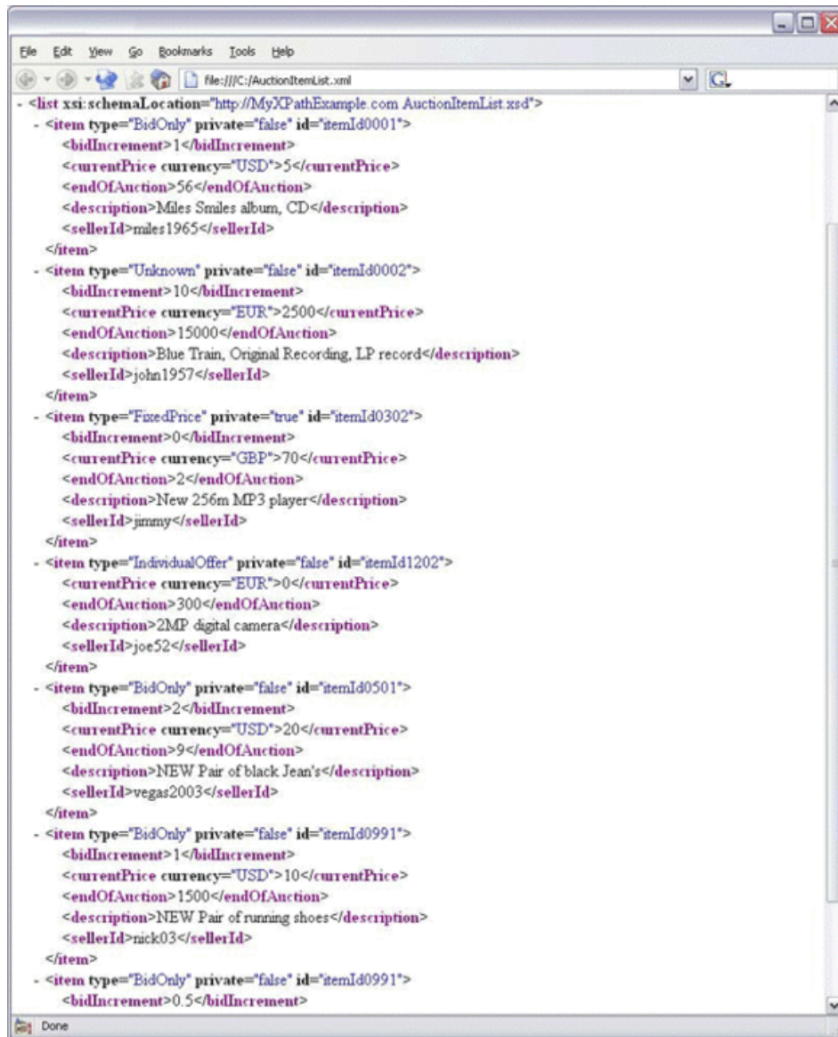
Figure 1. AuctionItemList.xml